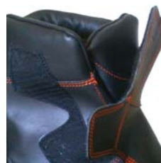
Protective Velcro overflap